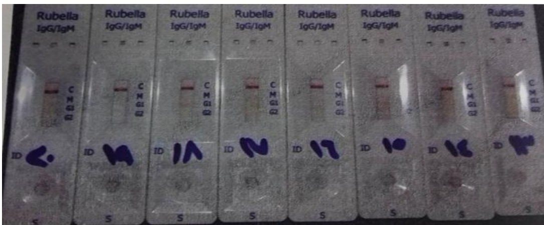
Figure2: The test for Rubella (strips 13,14,16,17,18,19,20 negative results, while strip 15 positive result).

The results of the study confirmed the importance of German measles and Toxoplasmosis among the population of Babylon province. These results were similar to the studies carried out in Baghdad and Mosul (17,18) respectively. The prevalence of infection in the current study was 33.3% , it is an approach to the percentages that emerged in the studies conducted in Iraq, including in Tikrit (19), where the ratio was 42.6% and when the results are balanced with the group of women shows that the highest percentage of positive cases within the age group 26-35 and by 46.6% , while the lowest cases in the age group 15-25 and by 26.6% as shown in table1, and this is consistent with many previous studies (17).