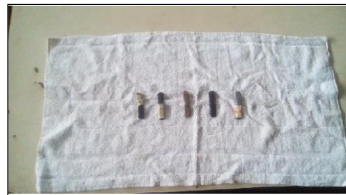
Fig. 2. Fabricated impact samples.