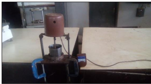
Fig. 1. Electric powered mechanical mixer.

fabricated electric powered mixer (Fig. 1). The new material was poured into a prepared impact sample mould. The composites were allowed to cure at room temperature (RT) for a period of 24 hours. After removal, the physical dimensions of the composites were measured in terms of weight, length and thickness before the commencement of the water absorption experiment. Each composite was carefully labelled and immersed with a string for ease of removal in a graduated measuring cylinder (Fig. 3). The water absorption experiment was set up in accordance with ASTM D5229 for moisture absorption of polymer composite materials. Measurements of weight, length and thickness were carried out at regular periodic intervals to evaluate the effect of water uptake at these intervals on the physical dimensions of the composites.