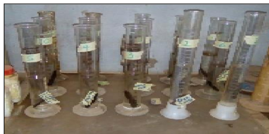
Fig. 3. Water absorption experimental set up