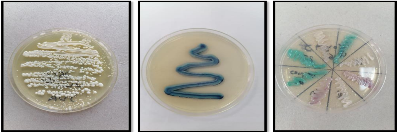
Figure (2): A: Micrography reveals colonies of Candida spp. developing on SDA at 37C for two days. B:

Micrographs showing C.tropicalis (blue). C: C.krusei (pink), C.parapsilosis (whiet), C.albicans (green), C.ciferrii (mauve) and C.glabrata (mauve) colonies growing on CHROMagar 2 days 37 C°.