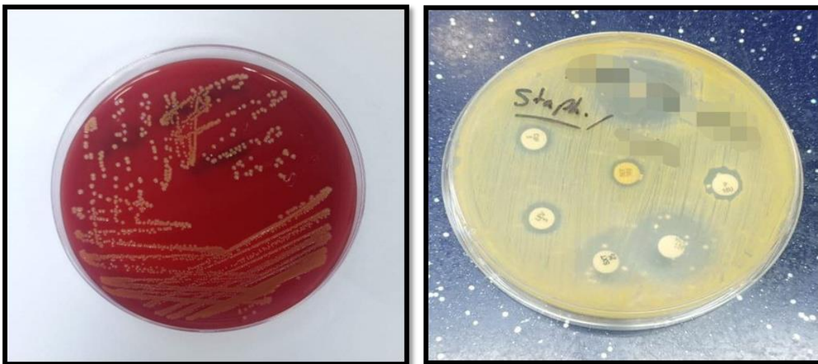
Figure (3): A: Staph. arues on blood agar. B: displays pharmacological sensitivity and resistance to Staph. arues on Mueller Hinton agar.

Table No. (5), displays pharmacological sensitivity and resistance. Ciprofloxacin (Cip), Meropenem (Mem), Levofloxacin (Lev), and Tobramycin (TOB) all proved responsive to Streptococcus pyogenes. Despite being resistant to Imipenem (IMI), Cefotaxime (CTX), Ceftriaxone (CTR), and Amoxicillin /clavulanic acid (Amc). Staph. saprophytic was resistant to Azithromycin (AZM) and erythromycin( E), however it was susceptible to cefotetan (CN) and Amikacin (AK) and imipenem (IMI) were both effective against Staph. aureus ,as shown in Figure No. (3).