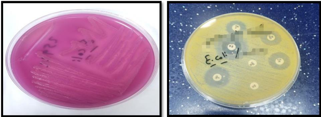
Figure (4): A: E.coli on MacConkey agar (MAC). B: displays pharmacological sensitivity and resistance to E.coli on Mueller Hinton agar.

Table No. (7) shows the sensitivity of negative bacteria to Gram stain that were isolated from the vagina after they were diagnosed and a drug sensitivity test was performed. It shows that both Klebsella spp. and E.coli Sensitive to Ciprofloxacin (Cip), Meropenem (Mem), Levofloxacin (Lev) and cefotetan (CN). Klebsella spp Sensitive to Nalidixic acid (NA) but E.coli was resistant to it. E.coli Sensitive to Aztreonam (ATM) While Klebsiella spp. was resistant to it, as shown in Figure No. (4). This result was consistent with (Najjuka et al;2016).