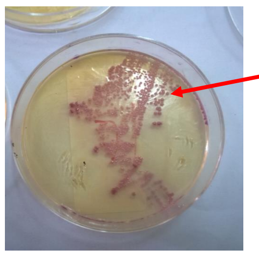
Figure-1: Staphylococcus aureus (mauve colonies) on Chrmoagar <sup>TM</sup> These S. aureus isolates were further investigated by growth on Chrmoagar <sup>TM</sup> specific for the identification and isolation of S. aureus as shown in figure (1). Sensitivity, specificity and diagnostic accuracy of cultural results on Chrmoagar <sup>TM</sup> were also 100%, 95.2% and 97.6% respectively.

Our results are based on a total of 100 cases with AD (the clinical diagnosis of AD patients is confirmed by dermatologists and specific AD criteria. Table (1) showed that from the total of AD patients investigated, S. aureus positive cases was correlated with 54 cases (54%), and 10 cases (20%) from the total control group, with significant statistical differences (P<0.05). All isolates were investigated and the detection was confirmed as S. aureus, Gram positive cocci, with mannitol fermentation, Catalase and Coagulase positive.