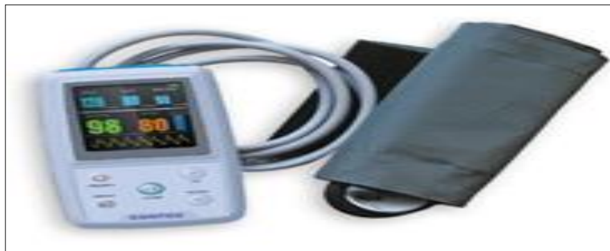
Figure 1.1 Contac ambulatory Blood Pressure Monitor Device.

At the time of fitting of the portable device, the difference between the initial values and those from office BP measurements were not greater than 5 mmHg. In the event of a larger BP difference the ABPM cuff was removed and fitted again.