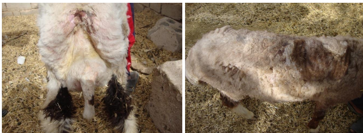
Figure (1) sheep infested with mange mite.

This study showed that the sheep were infested with Psoroptes communis var ovis , A larvated egg of Psoroptes ovis also noticed figure (5).