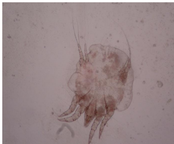
Figure (2) ovigerous female of Psoroptes communis var ovis x10.