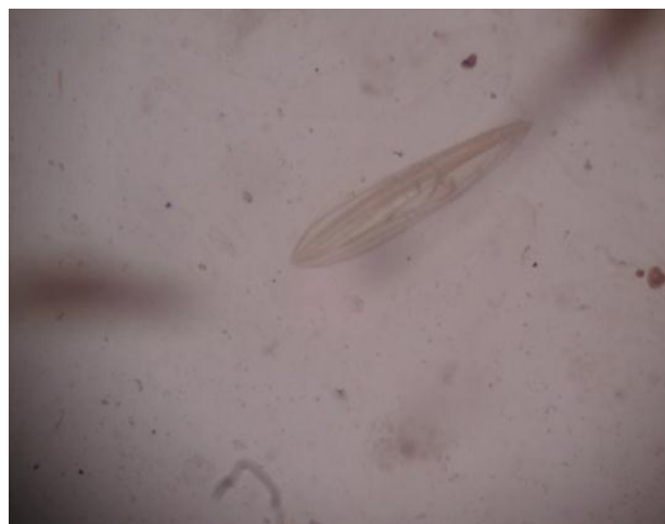
Figure (4) empty egg of Psoroptes communis var ovis after hatching x10.