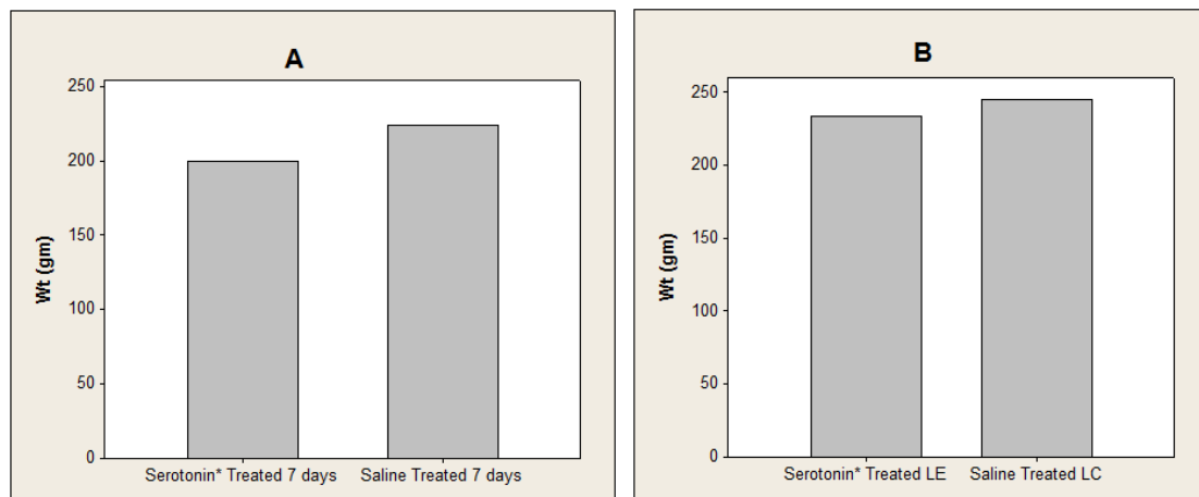
Figure (1): Effects of hyperserotoninemia on body weight of rats; "A" represents weights (gm) after one week of injected rats (serotonin*) with p-value = 0.003 compared to control group;"B" reveals long-term effects (serotonin*) on weights of rats with p-value = 0.025 compared to control group.