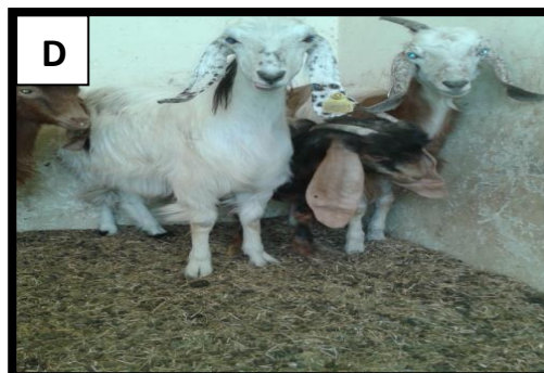
Fig(2)-(A)-healthy normal goats before infection. ( B) severe diarrhea in all groups during infection period. (C) stopped diarrhea after 2 week at 37.5 mg /kg D.innoxia formula treatment ( d) dehydration and bloody diarrhea and mortality in DMSO treatment group goat.