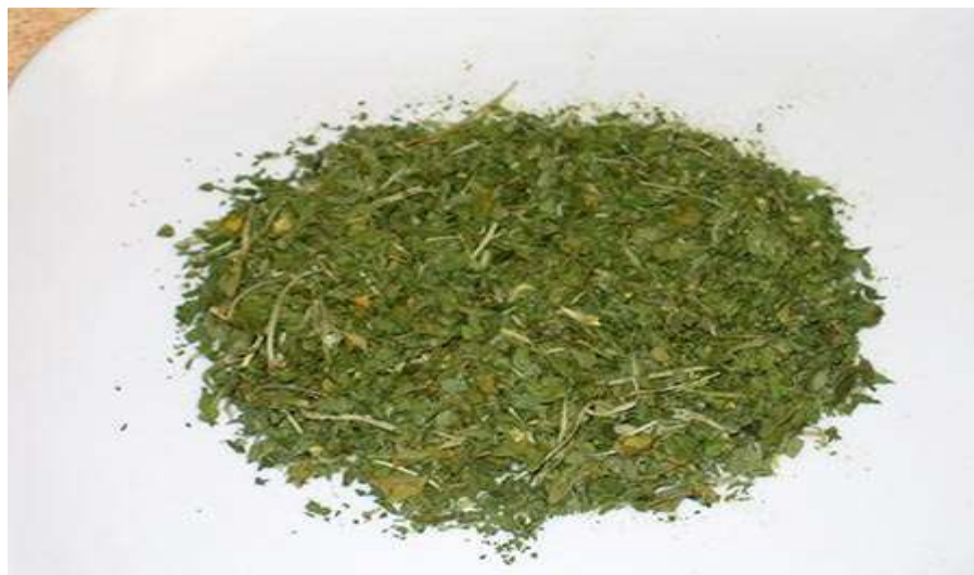
Pix (1) Ground leaves of Trigonella foenum-graceum (TFG).