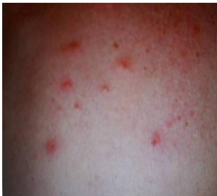
Fig.1: pruritic papules on the hand of patient with O.bacotii

Results: The physical examination for patients showed separate papules scattered over their( arms, shoulder ,legs) , restlessness and urticaria -like dermatitis.