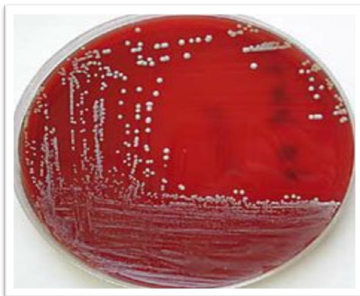
Figure (2). Pseudomonas aeruginosa colonies on blood agar