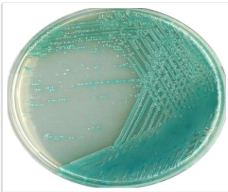
Figure(1). Pseudomonas aeruginosa colonies produced pyocyanin (bluegreen pigment) on orientation chrome agar.

Characteristics of cultural and morphological done by use nutrient agar, MacConkey agar, blood agar and orientation chrome agar. The colonies of P. aeruginosa isolates has smooth, large and oval shape, with flat margins. Production of pyocyanin by Thirty seven isolates (blue green stain) as figure (1), according to that mentioned by (12). The bacterial cells were gram-negative rods, short chain or arranged. All isolates produced without color colonies and did not ferment lactose sugar on MacConkey's agar. The Vitek 2 apparatus were support our results. All the isolates were positive to catalase test oxidase test. This results is in agreement with the results of ( 13 , 14).