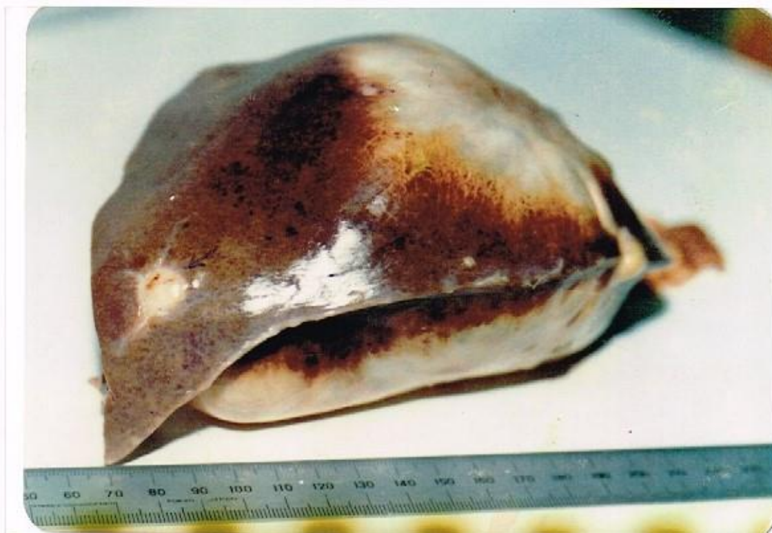
Fig (1) : Largest Hydatid Cyst found in liver of Cow ( Fifteen Cm. )

Viability of the protoscolices was tested by Eosin stain , so red protoscolices , it means living protoscolices while green means dead , proportion of live to dead protoscolices depend on the size and age of the cysts , small size ( young cysts ) have low ,number of dead protoscolices and vice versa .