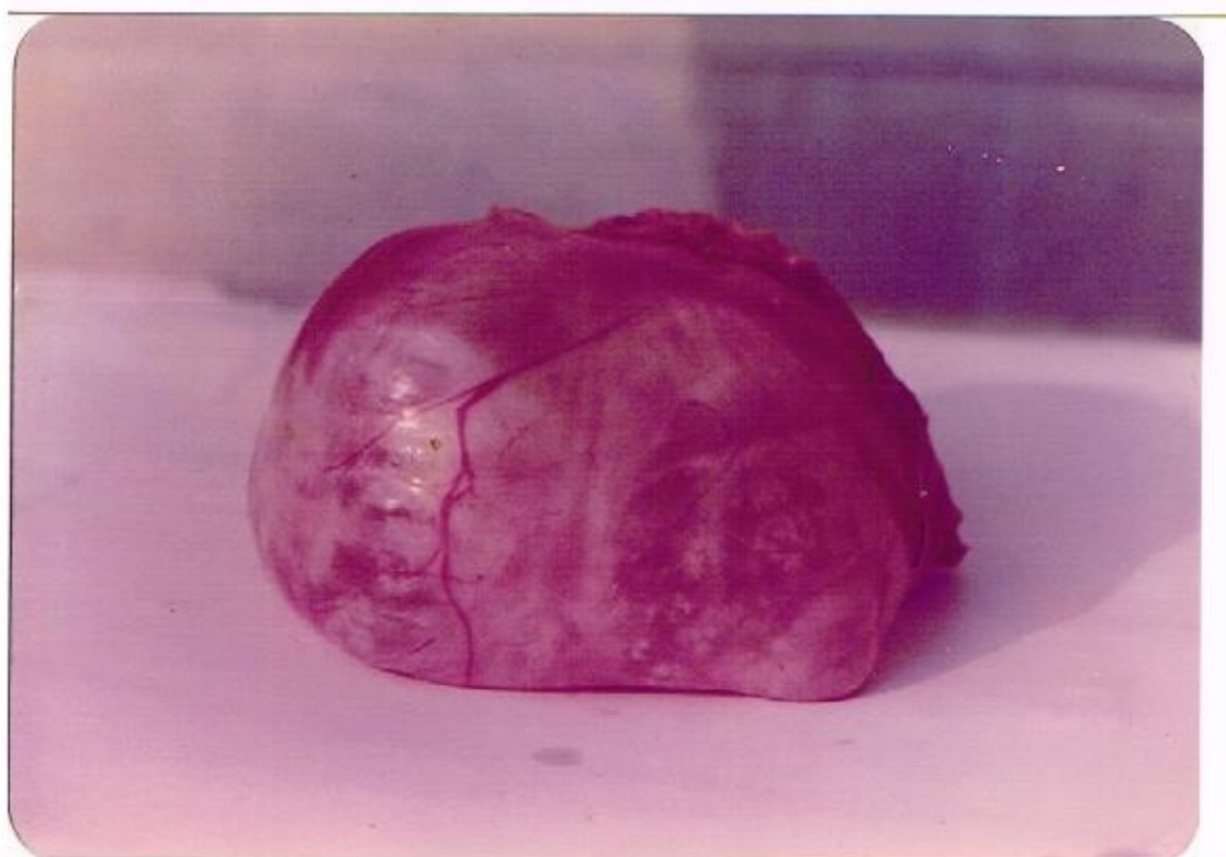
Fig ( 4 ) : Coenurus Cyst isolated from muscles of thigh of Ox .