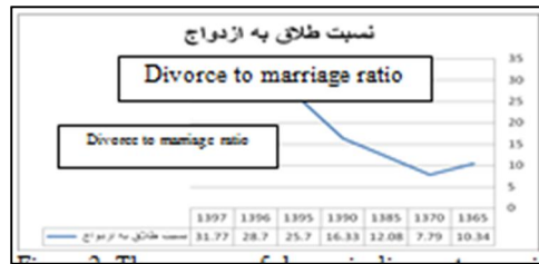
Figure 2: The process of change in divorce to marriage index between 1986 and 2016

As can be seen in the diagrams, general rate of marriage in recent years is decreasing and divorce to marriage ratio is increasing. As you can see, the trend has been increasing with mild slope after the revolution until 2017.